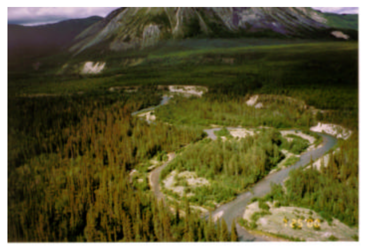
Figure 4.3 Representative section of Reach 1 of the Vents River.