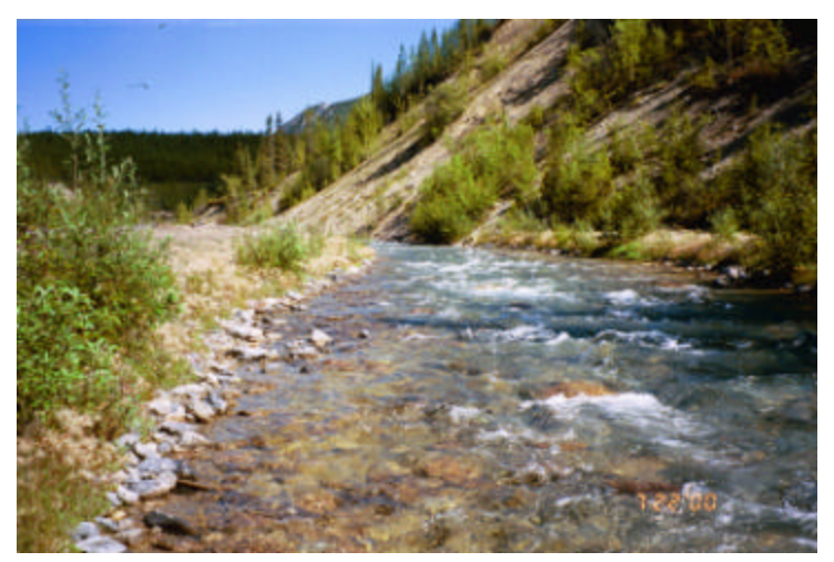
Figure 4.4 Representative habitat in the first reach of Lapie Creek.