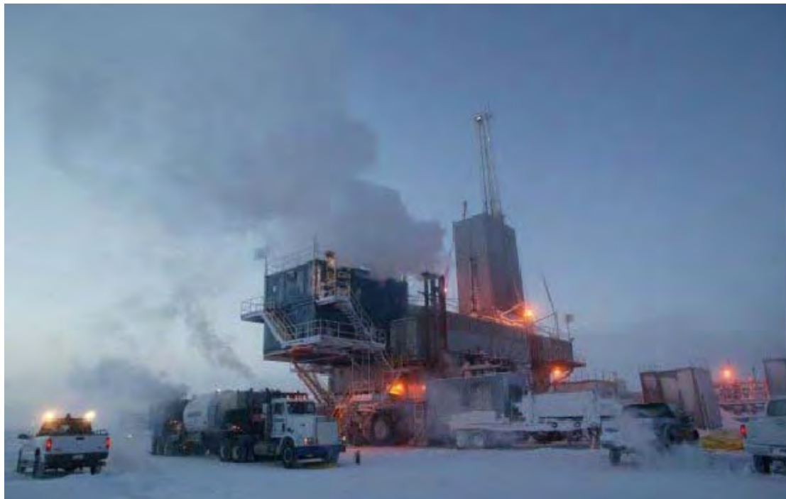
An oil and gas drilling site in northeast British Columbia

Membership in the task group is composed of representatives from government departments, regulators, the upstream petroleum industry and subject matter experts. Industry representation is coordinated through the Canadian Association of Petroleum Producers. Government representation includes the Ministry of Environment, the Ministry of Energy, Mines and Petroleum Resources, the OGC, the Ministry of Agriculture and Lands, and other government agencies and departments as needed. The task group has worked to support the development of a number of different technical standards.